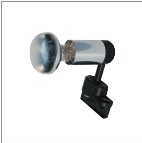
Spotlight 100W EUR 12.00 Code 019.010.188.000