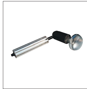
Connecting spotlight OCTANORM EUR 12.00 Code 019.010.187.000