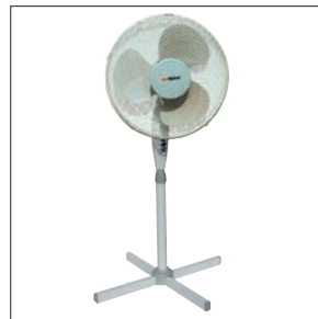
Standing fan Code 025.010.500.020 EUR 7.00