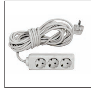
Extension cable 230V, 10A, 5m Code 019.010.279.000 EUR 10.00