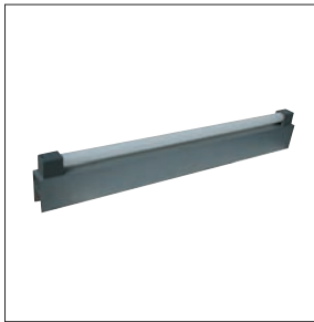
Fluorescent lighting SS30 type with D-170 tube Code 019.010.190.000 EUR 15.00