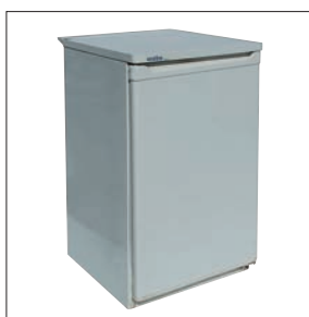
Refrigerator ARCTIC (180 l) Code 025 010 070 020 EUR 44.00