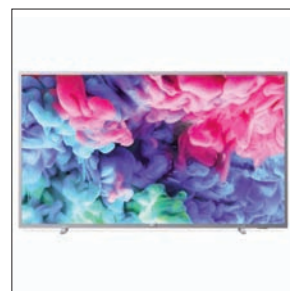
TV LED SMART 4K, UHD ultrathin (diagonal screen: 126 cm) Code 025 010 130 045 EUR 40.00/day