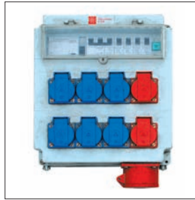
Electrical panel OCTANORM Code 019.010.275.000 EUR 120.00