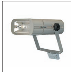
IVEN HQI 150W reflector EUR 35.00 Code 019.010.200.005