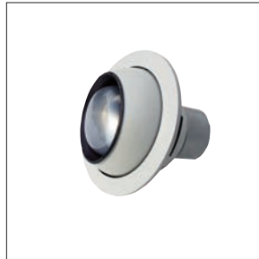
Spotlight 100W EUR 12.00 Code 019.010.170.000