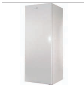
Refrigerator ARCTIC 255 l Code 025 010 020 199 EUR 55.00