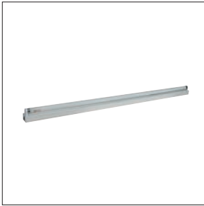
Fluorescent lamp FIA with complete electric installation 1x40W Code 019.010.110.000 EUR 15.00