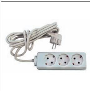
Extension cable 230V, 10A, 3m Code 019.010.277.000 EUR 10.00