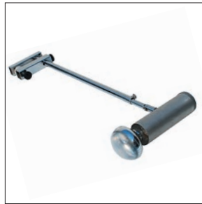
Arm spotlight 100W EUR 12.00 Code 019.010.181.000