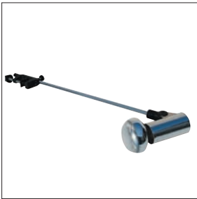
Arm spotlight EUR 12.00 Code 019.010.180.000