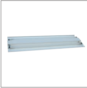
Fluorescent lighting OCTANORM type with double-tube D-171 Code 019.010.200.000 EUR 20.00