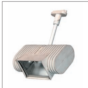
Halogen reflector SYMA STAR 300W EUR 35.00 Code 019.010.200.006