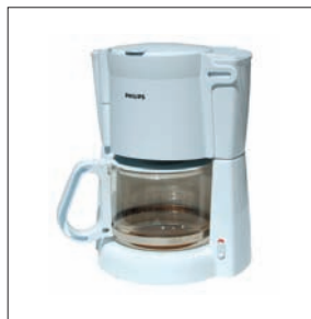
Coffee maker Code 025.010.120.010 EUR 4.00