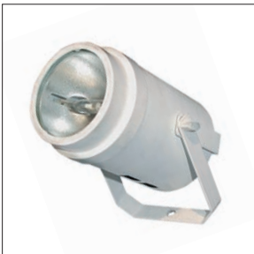
HQI 80W reflector EUR 35.00 Code 019.010.200.030