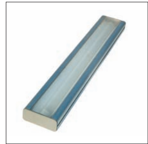
Fluorescent lighting SYMA STAR type Code 019.010.200.001 EUR 18.00