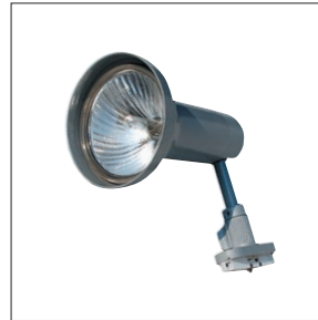
Halogen spotlight SY STAR 100W EUR 15.00 Code 019.010.185.000