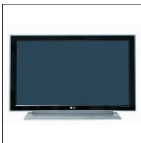
Plasma TV (diagonal screen: 107 cm) Code 025 010 130 040 EUR 25.00/day