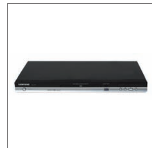
DVD Player Code 025 010 130 030 EUR 40.00