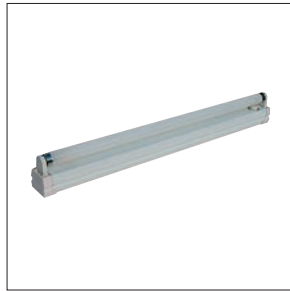
Fluorescent lighting SS30 type with D-170-A tube Code 019.010.190.001 EUR 18.00