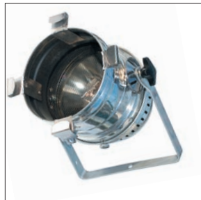
PAR64 500-1000W reflector EUR 40.00 Code 019.010.200.020