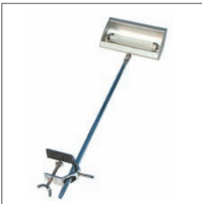
Arm reflector 300W EUR 35.00 Code 019.010.200.010