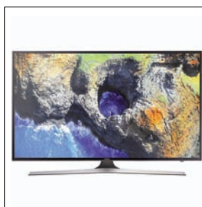
TV SAMSUNG UHD (diagonal screen: 163 cm) Code 025 010 130 047 EUR 60.00/day