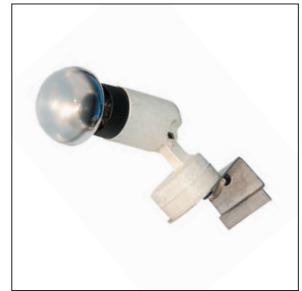
Spotlight SS30 100W EUR 12.00 Code 019.010.200.008