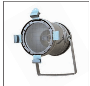
HIGHLIGHT HQI 150W reflector EUR 35.00 Code 019.010.390.000