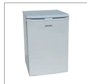
Cooler (140 l) Code 025.010.070.015 (55 x 61 x 84 cm) EUR 24.00