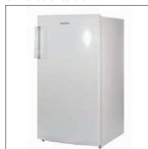
Refrigerator ARCTIC FB 155 Code 025 010 020 198 EUR 25.00