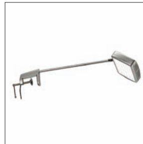
Arm reflector LED A++ 16W 1100LM 4000K EUR 35.00 Code 019.010.200.040